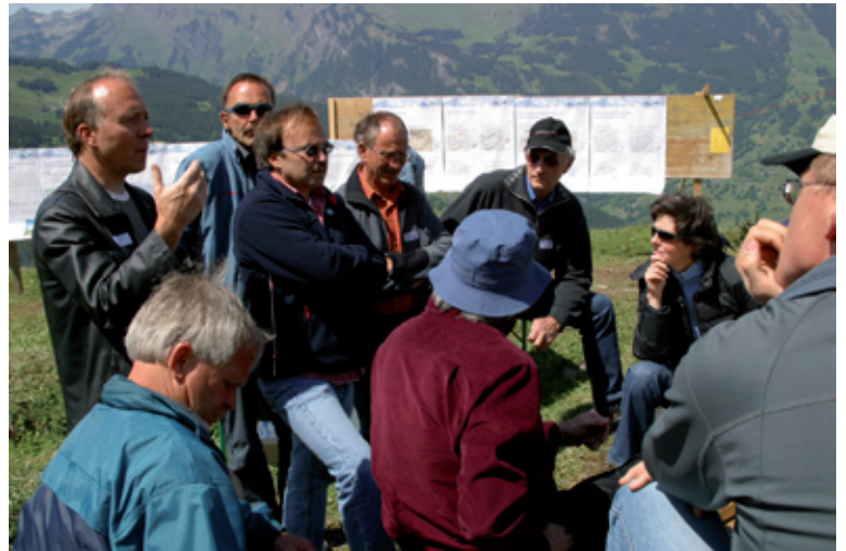
UNESCO meeting WHS Jungfrau-Aletsch on Alpigen, Grindelwald, 2005

We fully support the quest for management as mutual learning (Stoll-Kleemann & Welp 2008) and we conclude from our example that participatory processes indeed lead to social learning processes and contribute to mutual learning. However, we also have to take into consideration the inherent multilayer power play in participatory processes. This can cause stum-