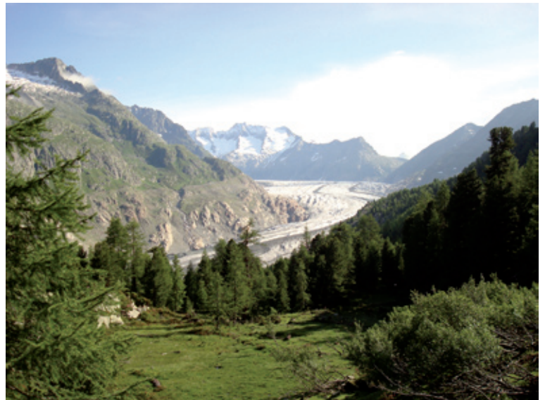
View from the Aletschwald towards the Great Aletsch Glacier

be given to cultural landscapes, and another group of stakeholders expected immediate economic gains. The management centre of the WHS Jungfrau-Aletsch initiated a multi-stakeholder participatory process to negotiate concrete objectives, measures and activities for the WHS in the hope to overcome the persistent conflicting expectations and to enhance ownership and common responsibility for the region. These are two aspects which are seen as crucial for increasing understanding and lowering conflicts in relation to protected areas (Mannigel 2008). But even though there is general agreement that public participation is an important principle and goal for achieving ecologically sustainable and socially just environmental go-